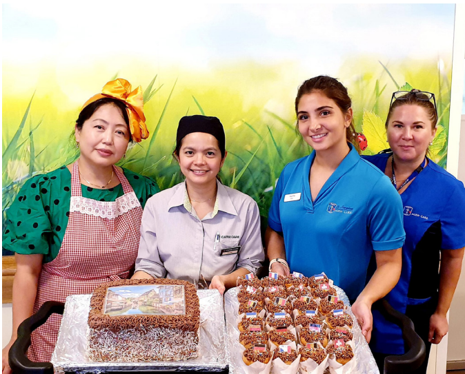
Treats for the Travelers