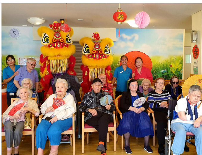
Lunar New Year celebration

The Lunar New Year celebration was a real scenic extravaganza. The appearance of the New Year Chinese Dragon delighted and amazed our residence with its bright colors and intricate dance movements of 'The Beast' accompanied by the traditional drums and cymbals.