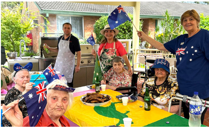
Australia Day celebration