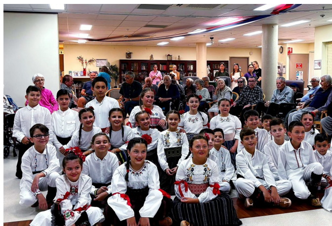
Dancing group with our residents