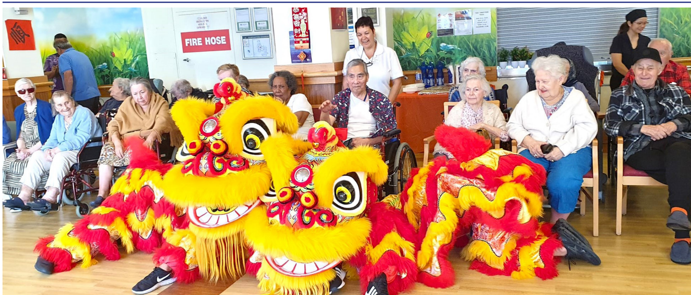
With the residents

The Lunar New Year celebration was a real scenic extravaganza. The appearance of the New Year Chinese Dragon delighted and amazed our residence with its bright colors and intricate dance movements of 'The Beast' accompanied by the traditional drums and cymbals.