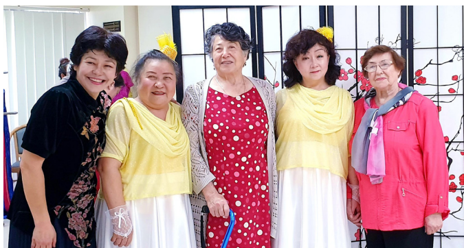
After the concert