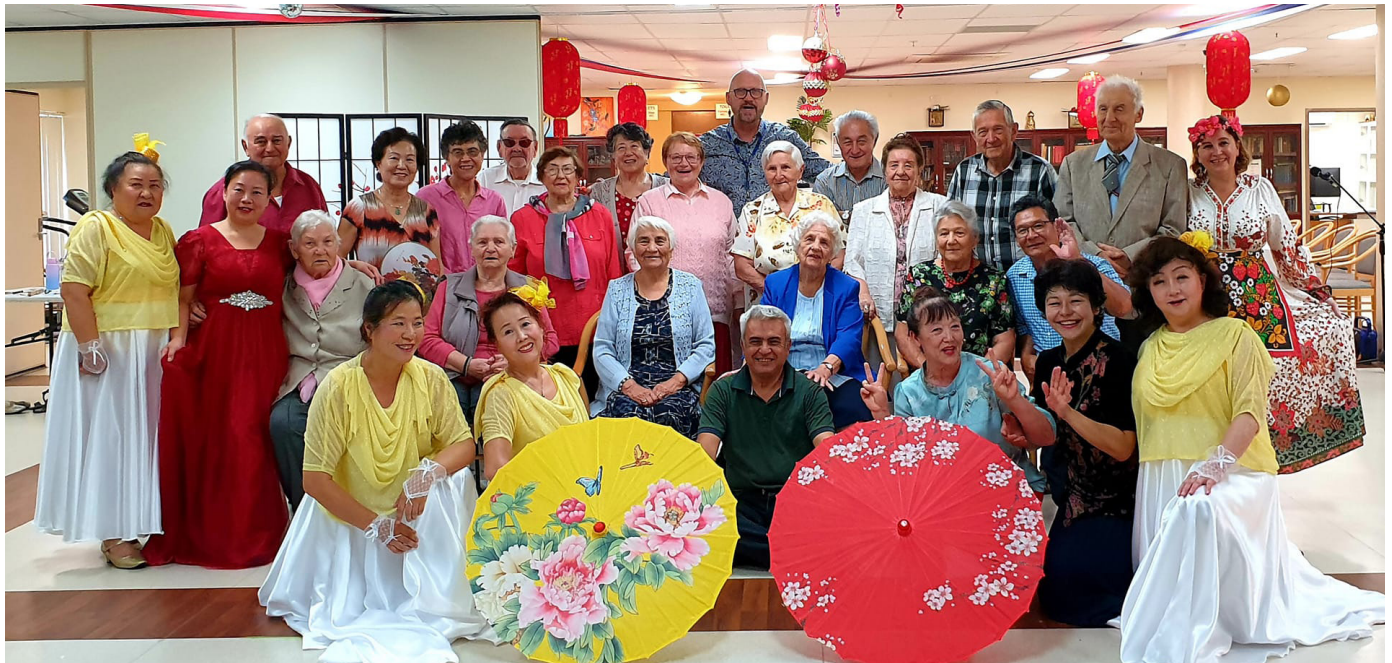
Lunar New Year celebration