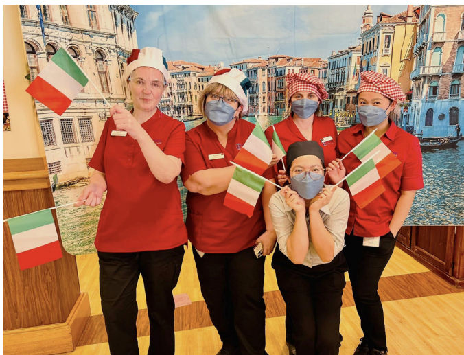
Italy Day Celebration