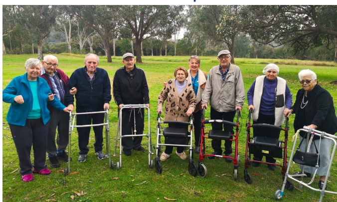
Trip to the park

This is well understood and appreciated by our staff and short excursions, especially to parks, are a regular feature of the recreation program at St Sergius.