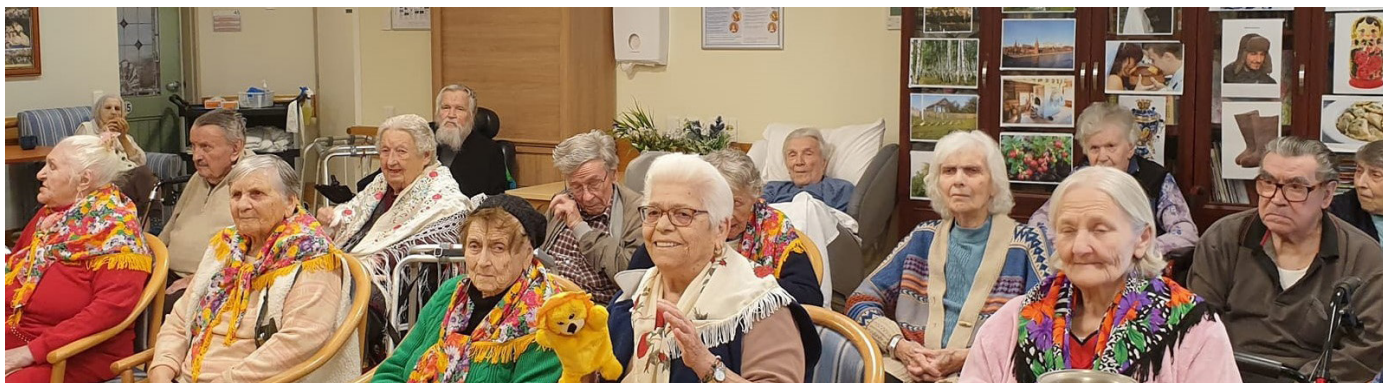
Russian culture appreciation day