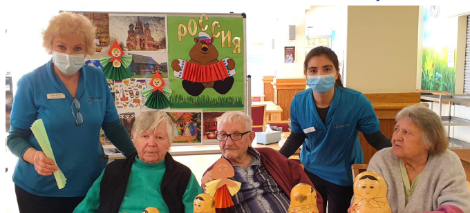
Russian culture day