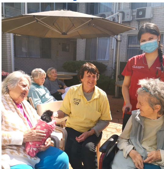
Animal Farm visits our residents