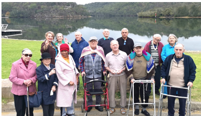
At the park