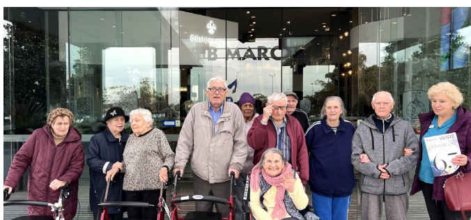
Trip to the club

It is always a pleasure to see the elderly people having an enjoyable time. Visits to a Club, especially the Serbian Club, provide an opportunity for just that. Such visits not only provide a welcome change of scenery for our residents, but also with an opportunity to meet new people and have an enjoyable lunch. Club visits are high on the priority list of our Recreation Staff.