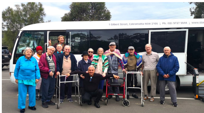
Ready for the trip