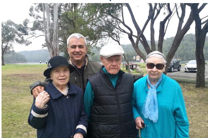
Walk in the park